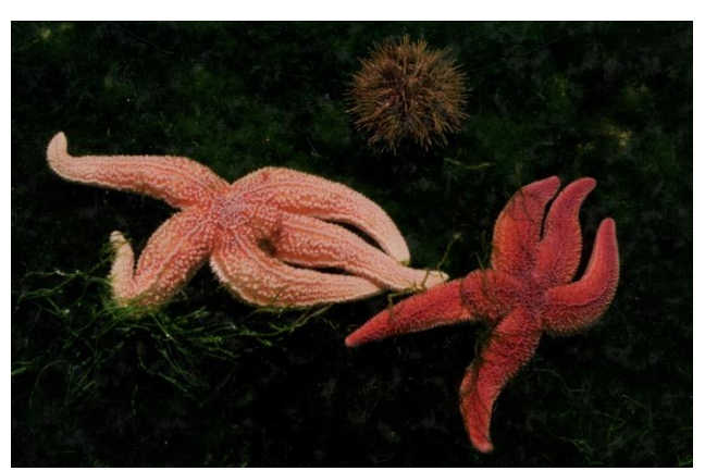
Star Fish: Prevertebrate Patten: Naval Radiation

"If any pattern becomes overly dominant, it may prevent other patterns from emerging. Weakness, inflexibility, and lack of coordination are often not due to structural or muscular problems but caused by a lack of process. When that process is actualised, we experience strength, flexibility, and ease in our movement and our mind. The Basic Neurocellular Patterns are an exploration of that process."